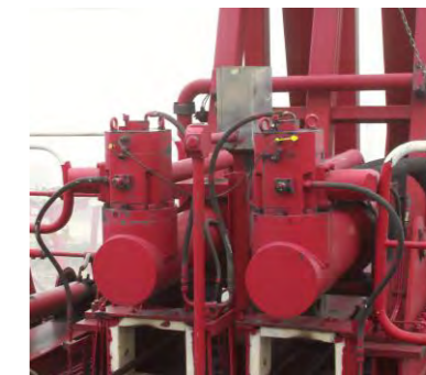
Hydraulic protection against snag