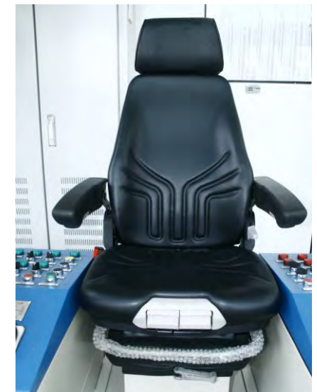
■ Damping suspension seat